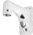
WV-QWL501-W Mount Bracket