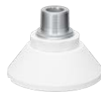
WV-QSR506M1-W Mount Bracket