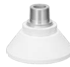
WV-QSR506M-W Mount Bracket