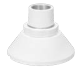
WV-QSR506F-W Mount Bracket