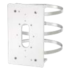
WV-QPL500-W Mount Bracket