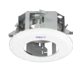
WV-QEM505-W Ceiling Mount Bracket