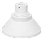
WV-QSR506-W Mount Bracket