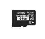
WV-SDB064G i-PRO SD Memory Card