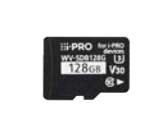
WV-SDB128G i-PRO SD Memory Card