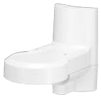
WV-QWL502-W Mount Bracket