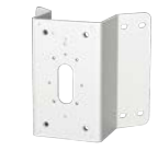
WV-QCN500-W Mount Bracket