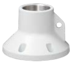
WV-QCL101-W Mount Bracket