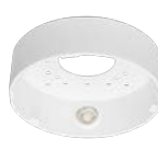
WV-QJB505-W Base Bracket