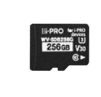
WV-SDB256G i-PRO SD Memory Card