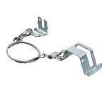
WV-Q105A Mount Bracket