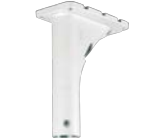
WV-QCL501-W Mount Bracket