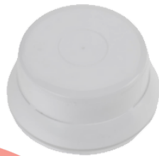
White Blanking Cap