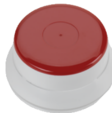
Red Blanking Cap